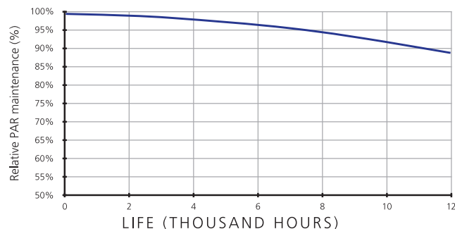
TYPICAL PAR MAINTENANCE